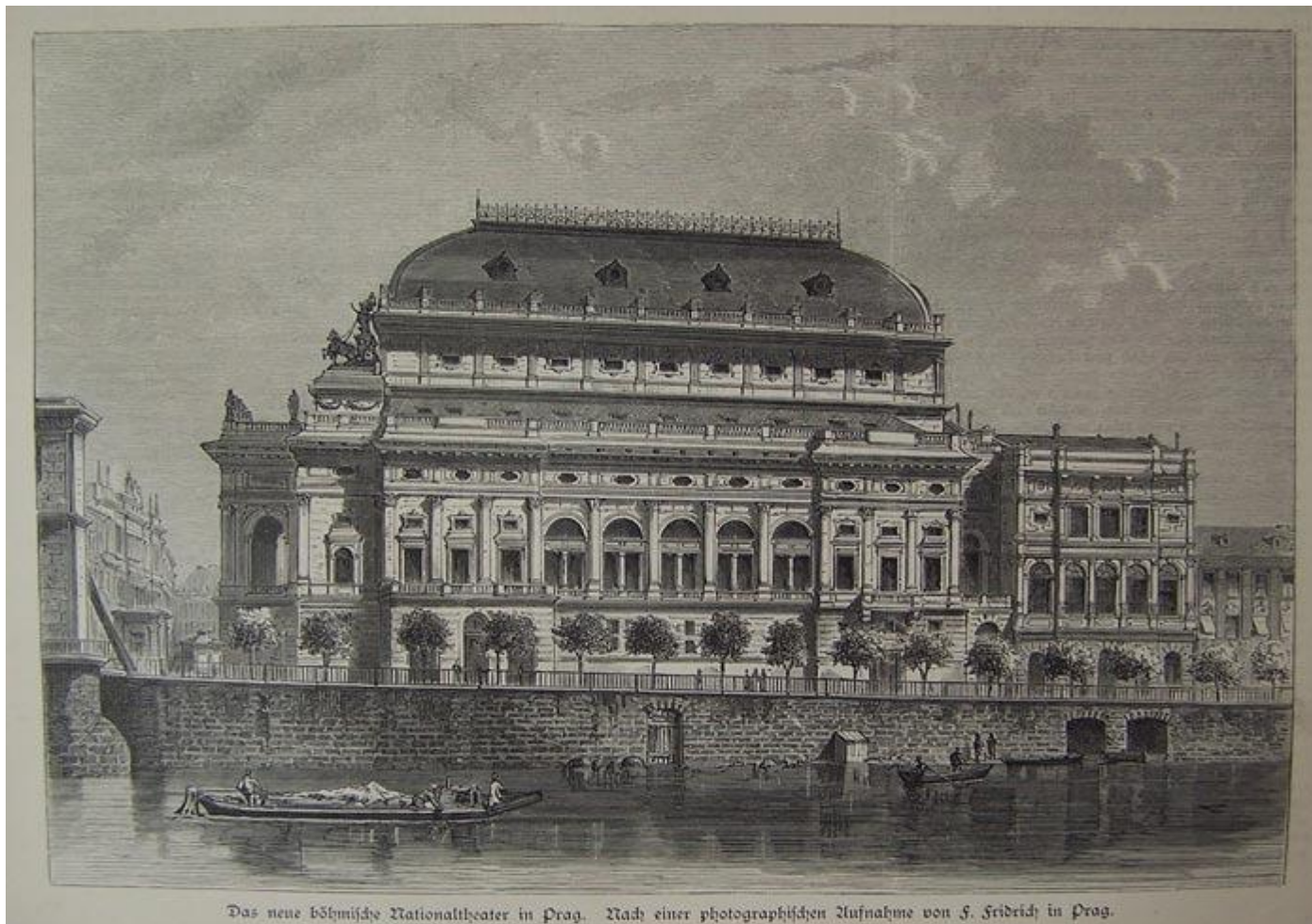
Das neue böhmische Nationaltheater in Prag.